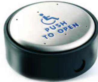
PBR H 152mm (o) x 16mm (d)

Four types of standard push buttons are offered: