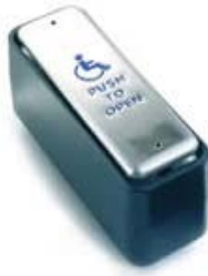
PBJ H 120mm (h) x 38mm (w) x 16mm (d)